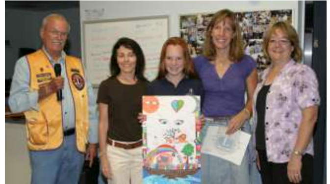
Epiphany Cathedral School