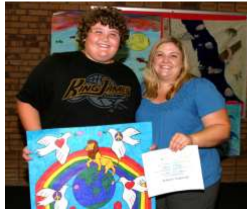
Venice Middle School