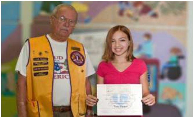
Laurel / Nokomis